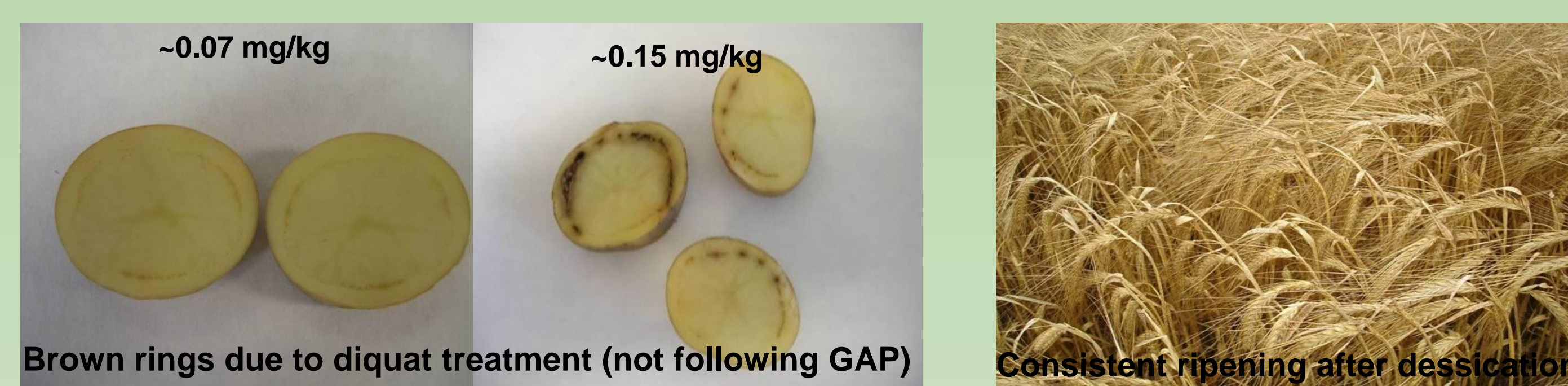
Figure 2: Potatoes treated with diquat and barley treated with diquat and paraquat